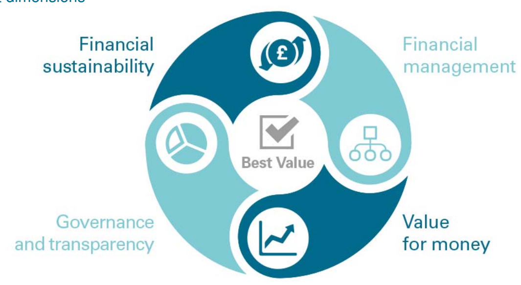
Exhibit 5 Audit dimensions

20. In the local government sector, the appointed auditor's annual conclusions on these four dimensions will contribute to an overall assessment and assurance on best value.