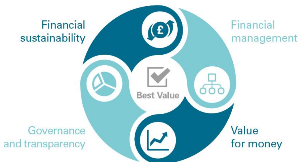
Exhibit 1 Audit dimensions