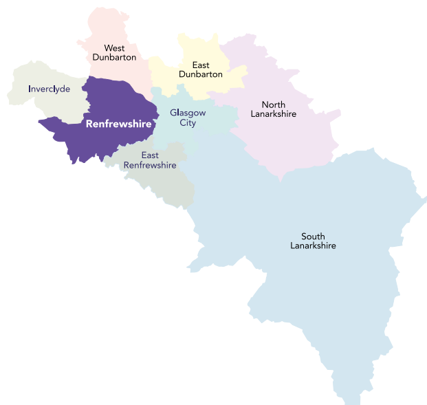
Map of the 8 Local Authorities within the Clydeplan area