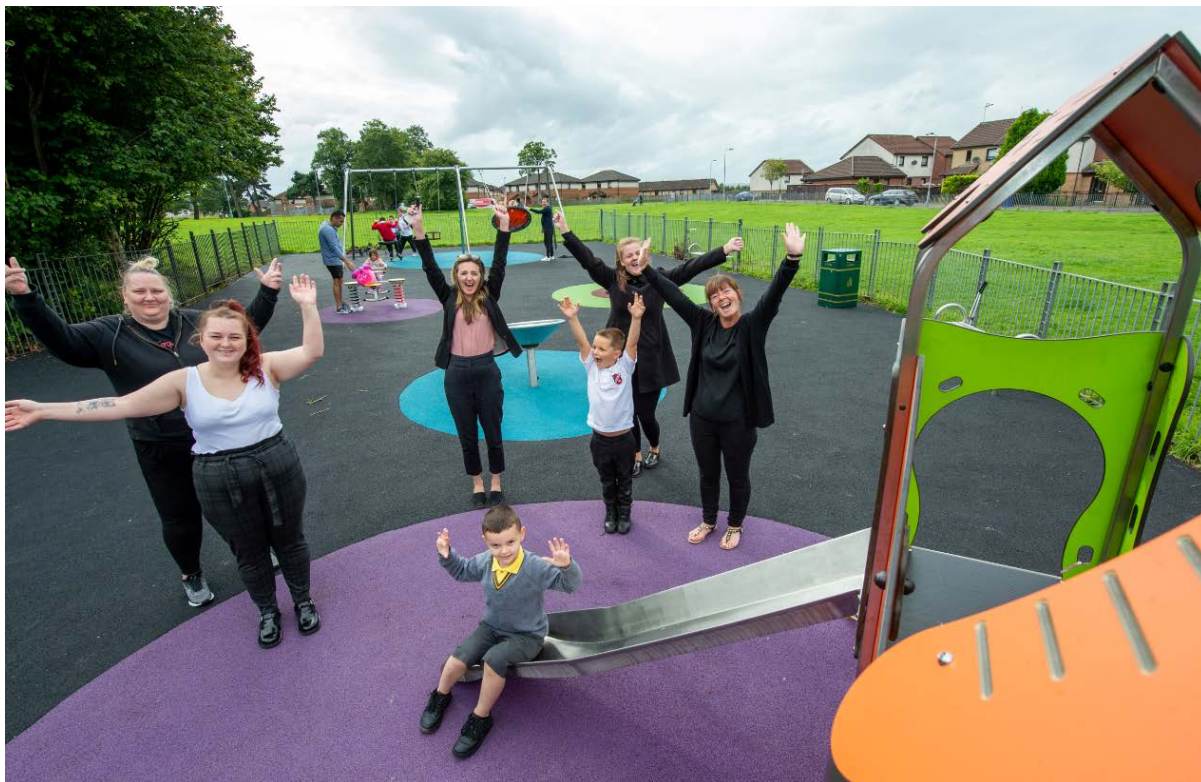
Howwood Community council and friends celebrating their new improved park: