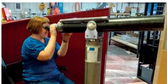
Project team testing the Observatory compensatory experience