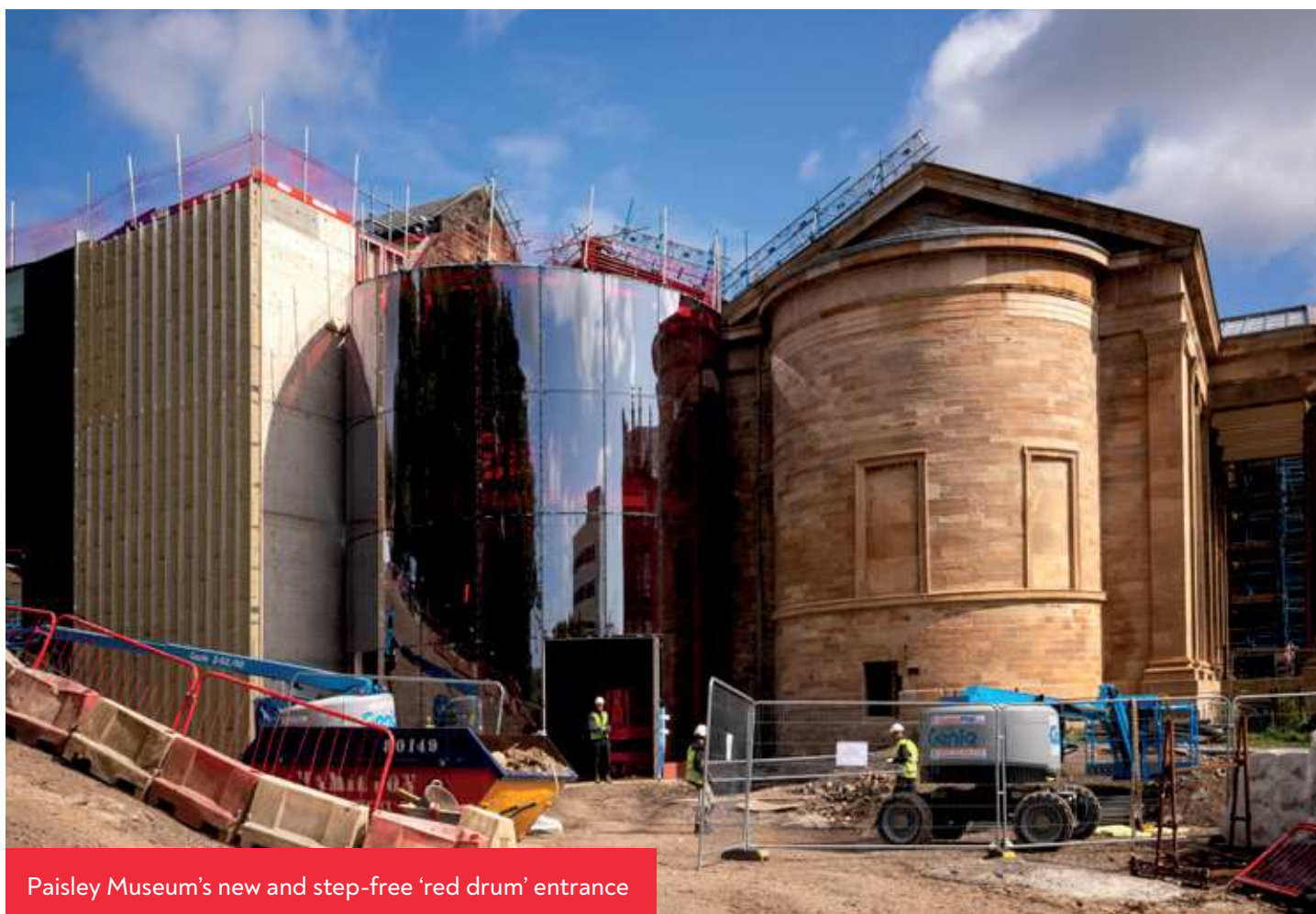
Paisley Museum's new and step-free 'red drum' entrance

We have reached several milestones since our last edition, but perhaps none as visually striking as the emblematic 'red drum' entrance. We would like to take this opportunity to thank you for helping us meet these achievements and deliver a world-class visitor destination in Paisley's town centre.