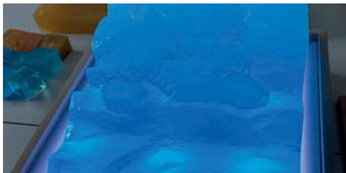
Testing resin lighting to simulate the transformation of water to ice in the Birdie Bowers explorer display