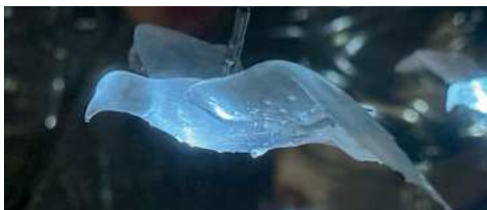
Glowing miniature pigeons in an 'infinity mirror' exhibit tell the story of Alexander Wilson and the extinct Passenger Pigeons