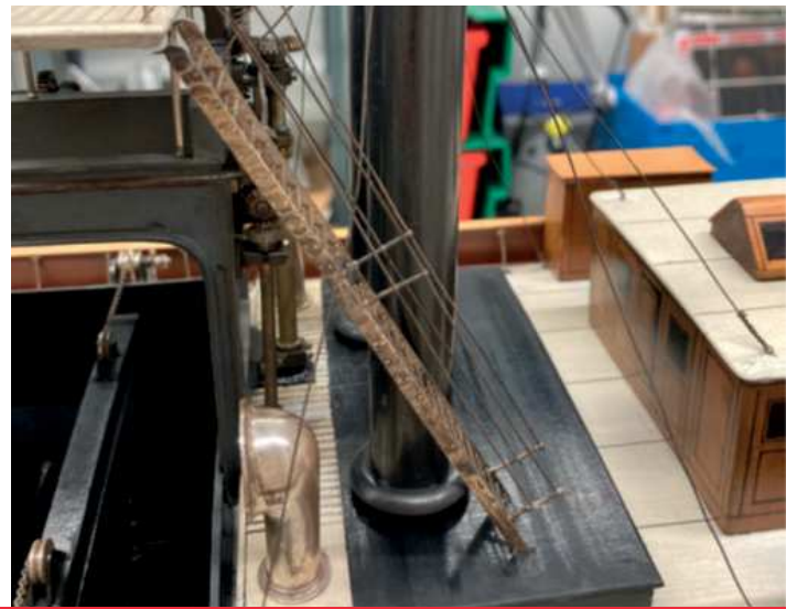
Before and after images of dust and paint repairs undertaken by our specialist conservators