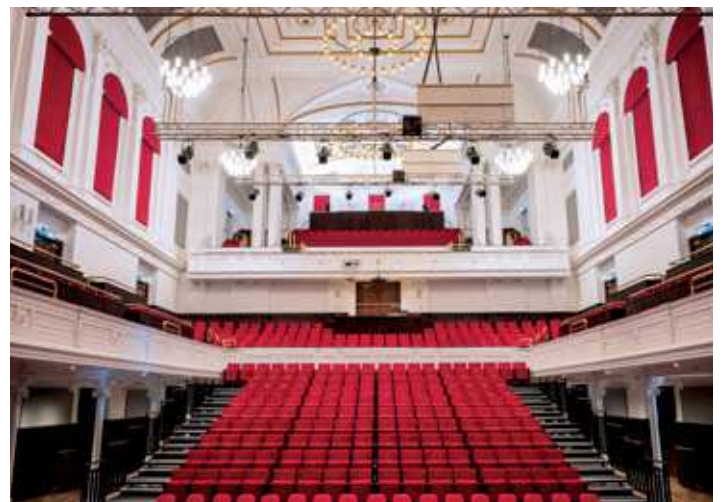
Main Hall, Paisley Town Hall