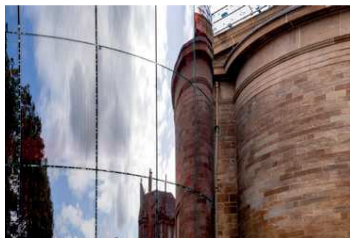
A reflection of Paisley's High Street on the stunning glass panels