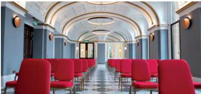
Loom Loggia, Paisley Town Hall

Paisley Arts Centre is scheduled to reopen next year where it will host more intimate performance space for audiences and performers to enjoy.