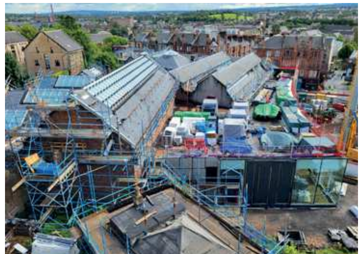
Aerial view of Paisley Museum's many roofs, including the new west extension