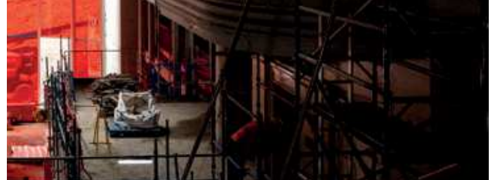
Internal view of the new 'red drum' entrance

Our exhibition contractors have started manufacturing bespoke display components including display cases and furniture, object mounts and digital interactives. Many of these displays require complex techniques to ensure that the stories are told in the most impactful manner. This includes no fewer than 67 audio-visual displays, allowing visitors to explore our shared history through additional information, films, and even interactive games.