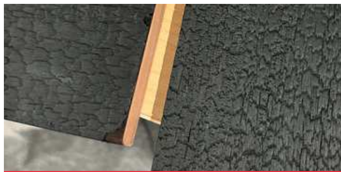
Charred wood effect samples for the Alexander Wilson story

Our commitment to creating unique displays led us to examine specialist sculpted resin components, crafted by sub-contractor Beaufort Bespoke, which depict the transformation of water into ice for the early years story of explorer Birdie Bowers. We also evaluated miniature, illuminated pigeon models within an 'infinity mirror' showcase for the story about Alexander Wilson's recording of the now-extinct Passenger Pigeons. Additionally, we explored elements related to the Observatory Compensatory Experience and sections of the Interactive Weaving Studio.