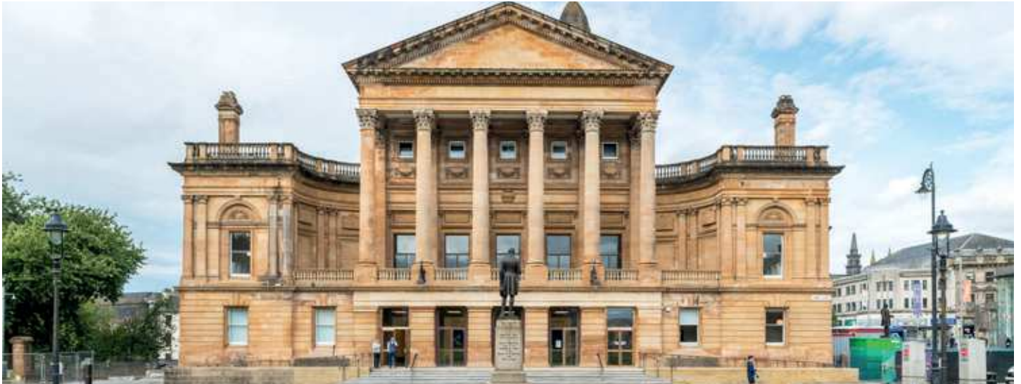
Paisley Town Hall

Paisley has been delivering a pioneering approach to cultural regeneration. The major investment of £100m in cultural venues and outdoor spaces began in 2016, with The Secret Collection. The facility replaced a vacant department store and is the first publicly accessible museum store on a UK high street. The Secret Collection will complement Paisley Museum by hosting educational visits and showcasing artefacts not on display at the museum. Renfrewshire Council's investment then enabled work to begin on refurbishing Paisley Museum, Paisley Town Hall, Paisley Art Centre and creating a new home for Paisley Central Library.