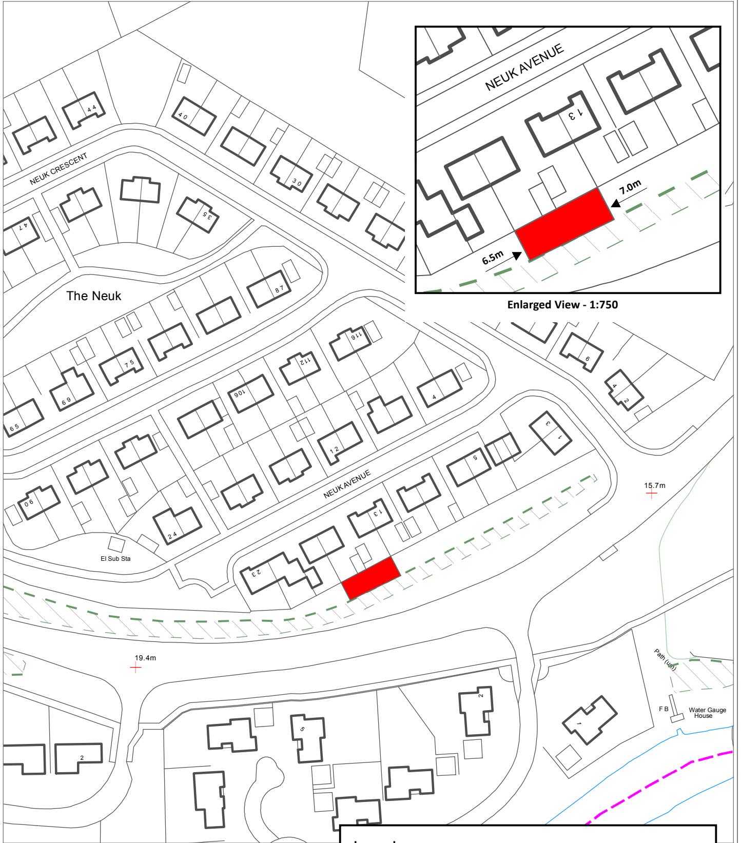
Enlarged View - 1:750