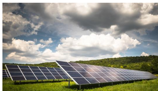
Figure 1: Example of solar farm