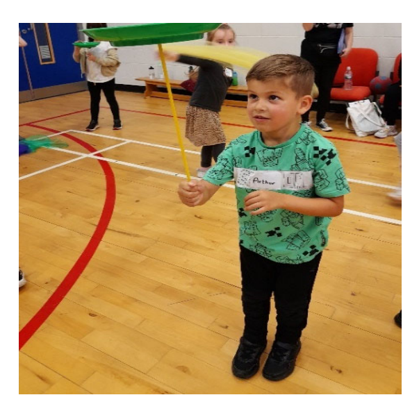
Practising Circus Skill