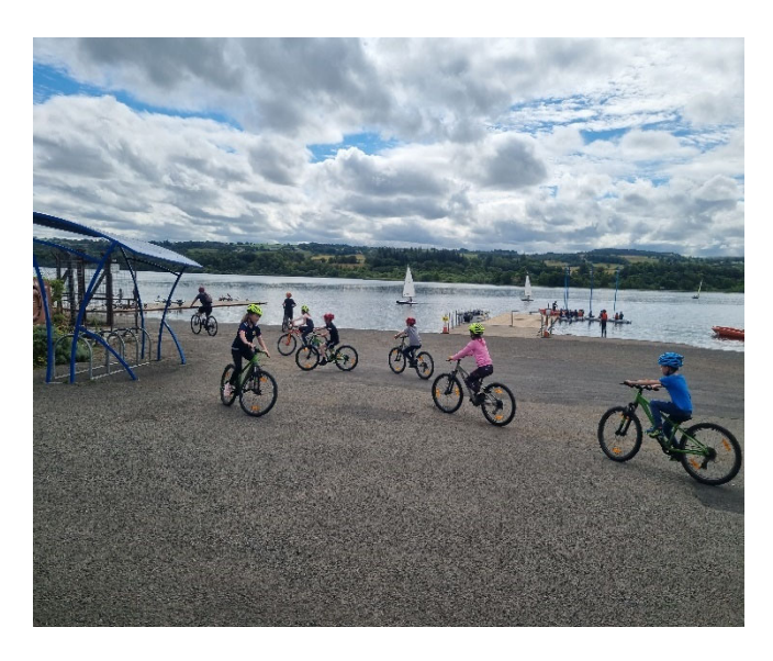
Cycling at Castle Semple Outdoor Centre