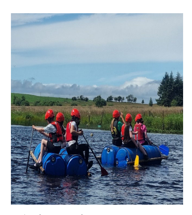
Archery and Rafting at Lapwing Lodge Outdoor Centre