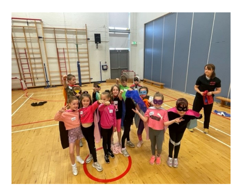
Moxi Drama Activities took place at all venues