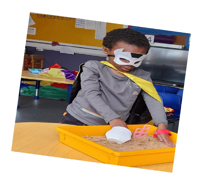
Not all Superheroes wear Capes!