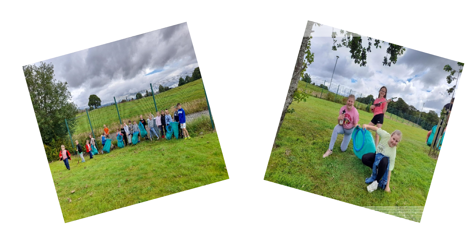
Children took part Litter picking projects and learning from the Team Up to Clean Up Team