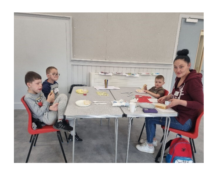
Family Learning Activities at Southend includes parents and children preparing lunches