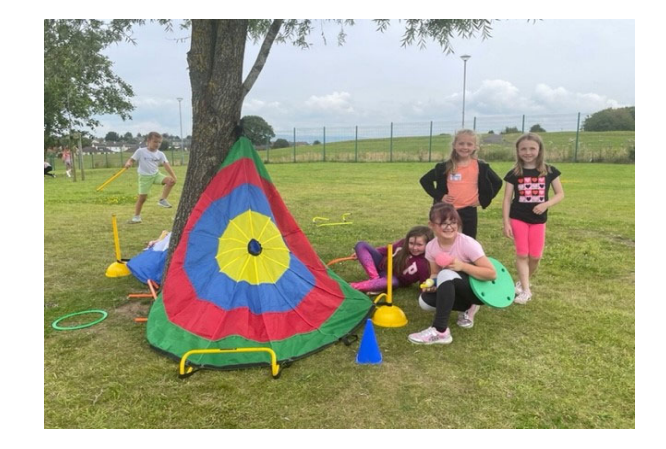
Indoor and Outdoor Fun at West Johnstone Campus