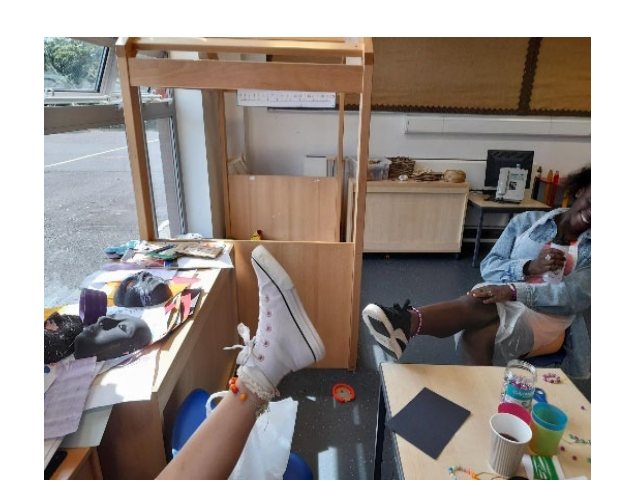
Some of our many Arts and Crafts Projects