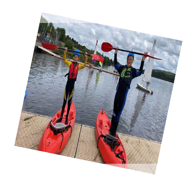
Watersports at Castle Semple Outdoor Centre