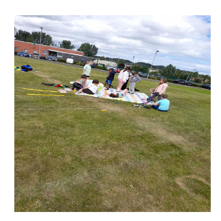
StreetStuff Activities at the Summer of Fun Camps