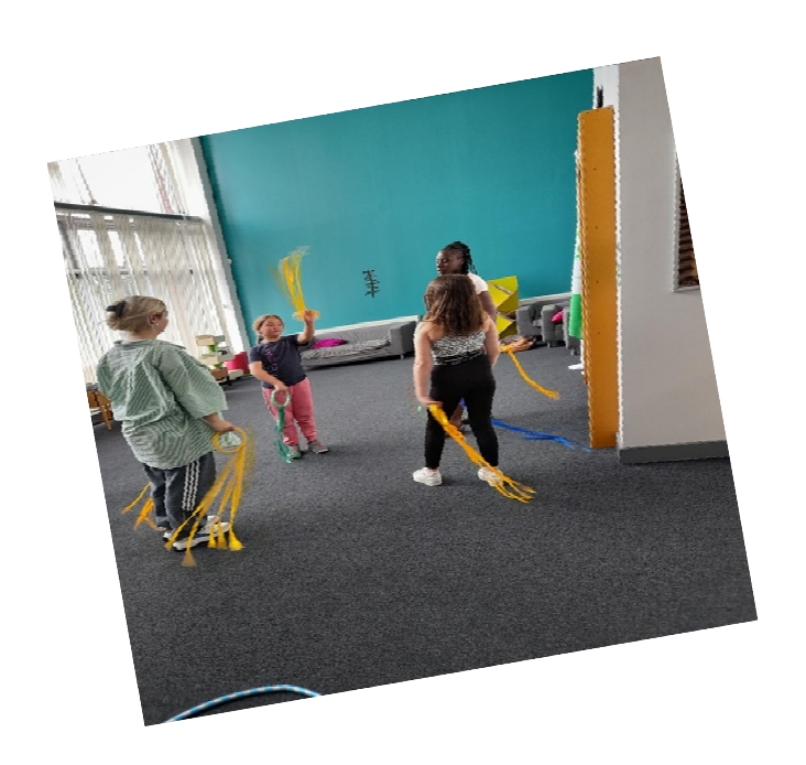
Dance Skills from Right2Dance