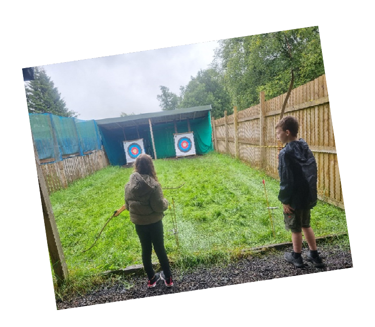
Archery at Lapwing Lodge