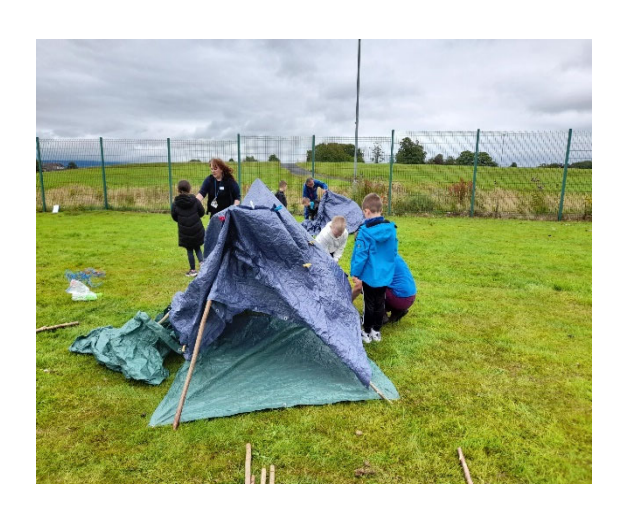
Den Building equipment and instruction was provided at most venues