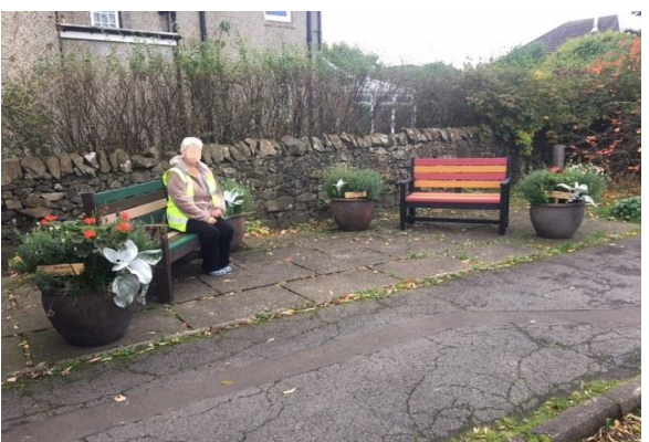
The Earth and Fire Benches

4.8 This funding programme underlines the wide range of significant progress which continues, at pace, to ensure the Council is a climate-responsible organisation, recognising our impact on our environment, our opportunities to do things differently and our ability to work with others to influence meaningful and long-lasting change, while making our communities safer, fairer and healthier places to live, work and spend time in.