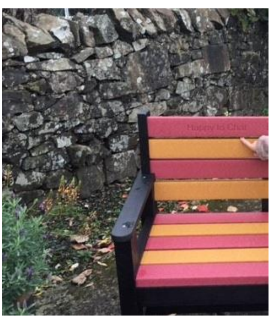
Happy to Chat Bench