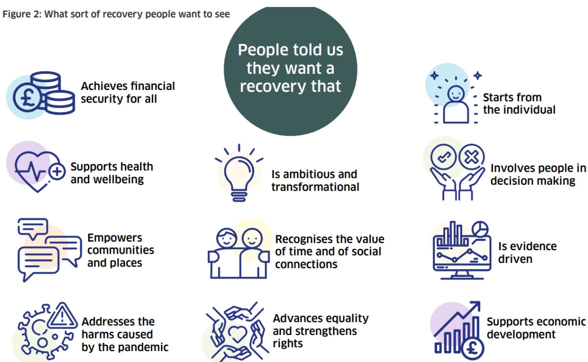
Figure 2: What sort of recovery people want to see