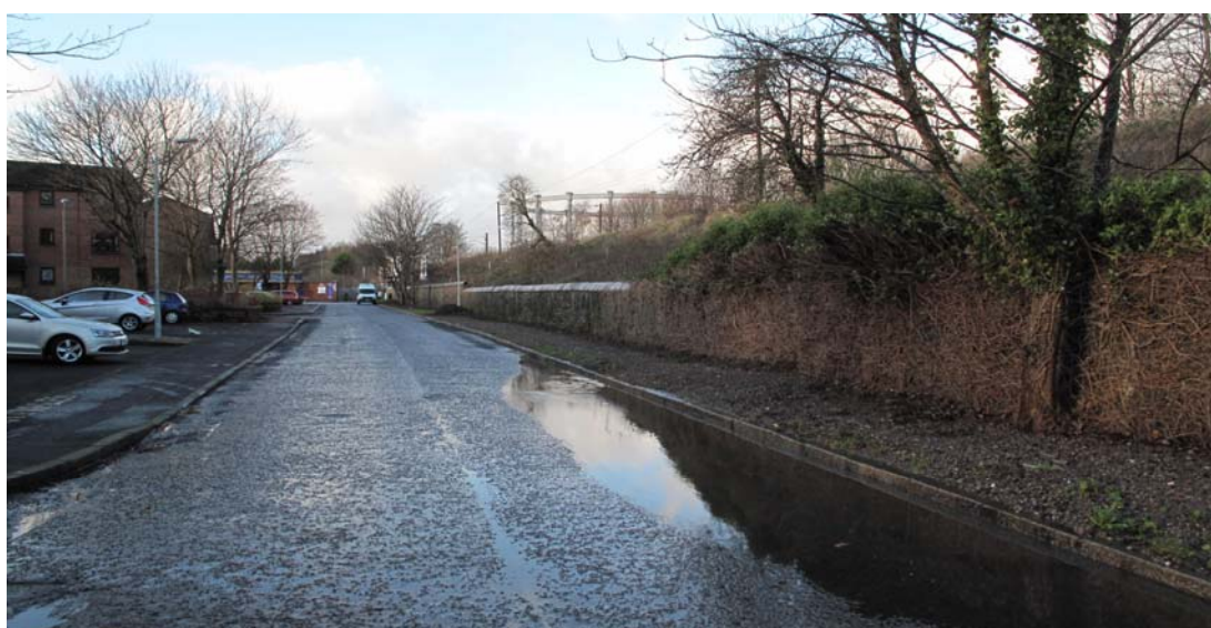
Brown Street in progress