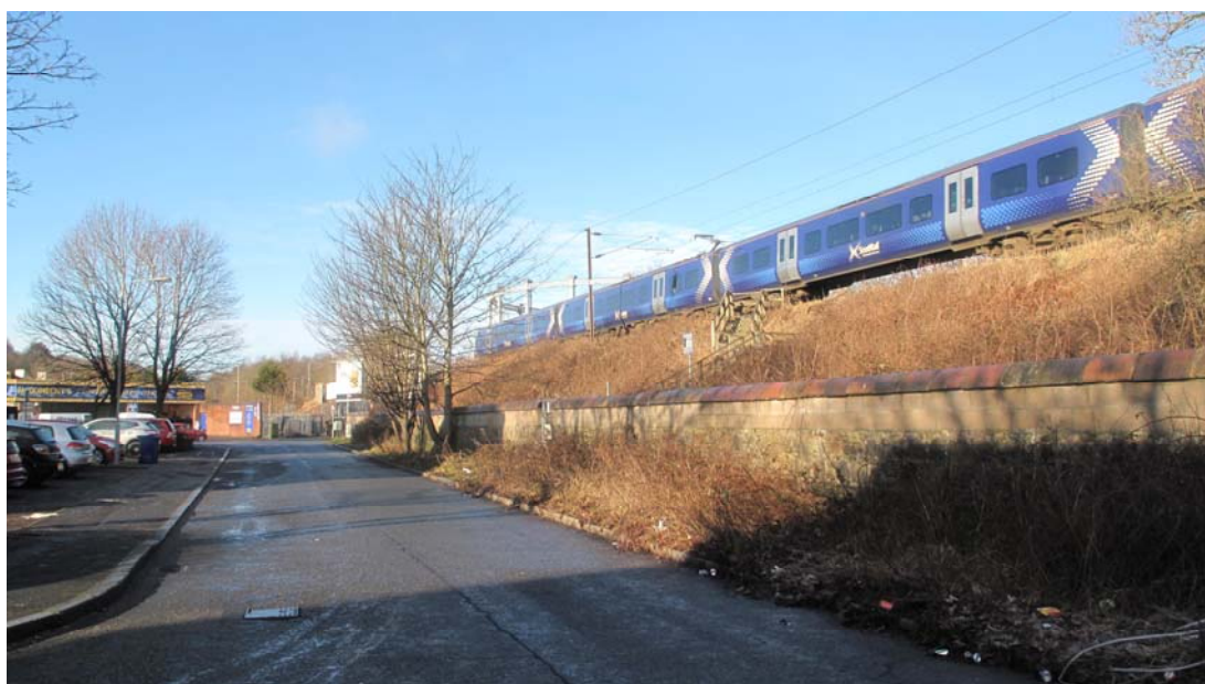
Brown Street before start of works

£1,900 was awarded to Paisley West & Central Community Council for two stalled sites at Brown Street and Underwood Lane in the West End of Paisley. The site at Brown Street, situated next to the railway has been cleared of undergrowth and is due to be planted (photographs below). The second site at Underwood Lane will be cleared and planters and a bench will be installed on the site. On completion of these projects a celebration event will be held at Underwood Lane, with all partners involved in the projects in attendance.