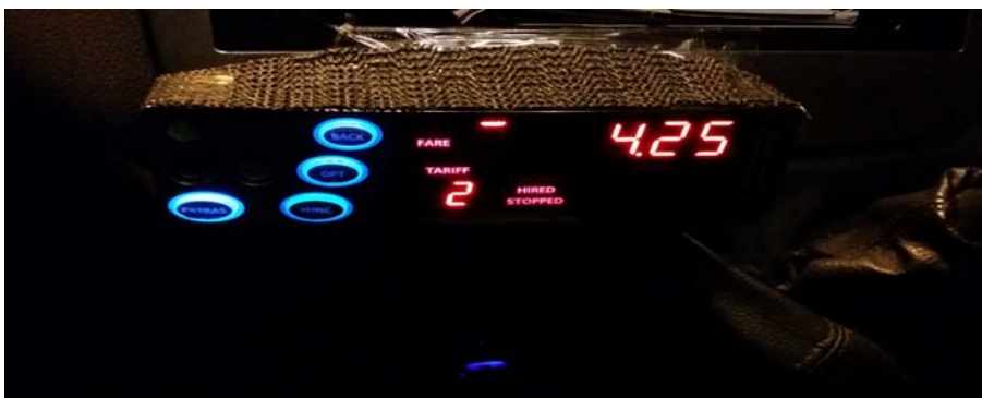
Figure 1: The Halda & Aquila meters all start Tariff 2 on £4.25 Flag Fall