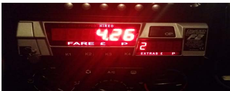
Figure 2: Probably the most common meter at present is the Digitax that starts Tariff 2 on £4.26 Flag Fall.

I am also led to believe that there are one or two meters of a less popular brand, that are being used that start £4.27 on Tariff 2.