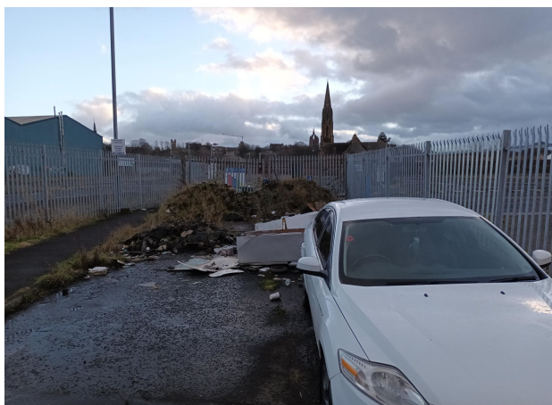
MacDowall Street, Park & Ride

3.15 At McDowall Street Park and Ride, Paisley, the landowner moved flytipping and erected fencing to prevent further instances. The Taskforce met with the landowner at Barbush Farm, Johnstone who arranged to uplift flytipping and is assessing the feasibility of a staggered gate at the road access point. Sustrans contacted Renfrewshire Council as a cyclist reported flytipping at the side of the Cycle Path, the land was owned by a nearby business who removed the waste (photos below).