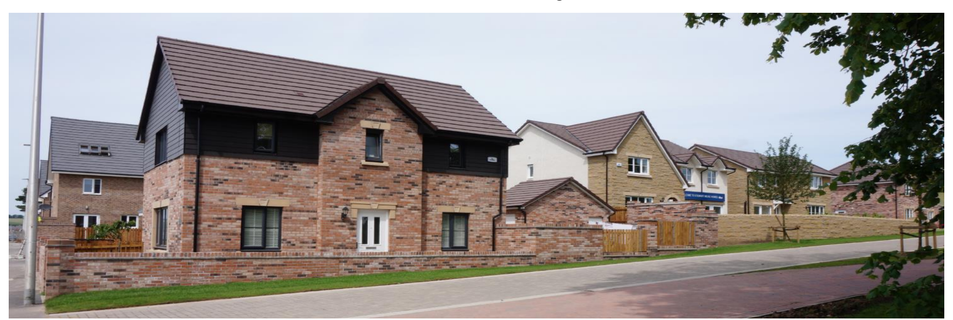
Dargavel Village, Bishopton