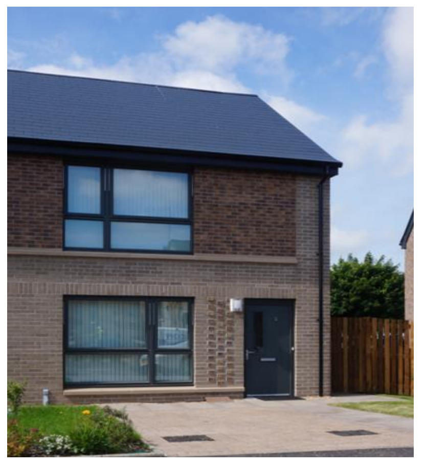
New Affordable Housing development in Renfrew, Sanctuary Scotland

Over the past two years, the health and housing hub delivered by Linstone Housing Association, has had 228 referrals that led to 295 appointments