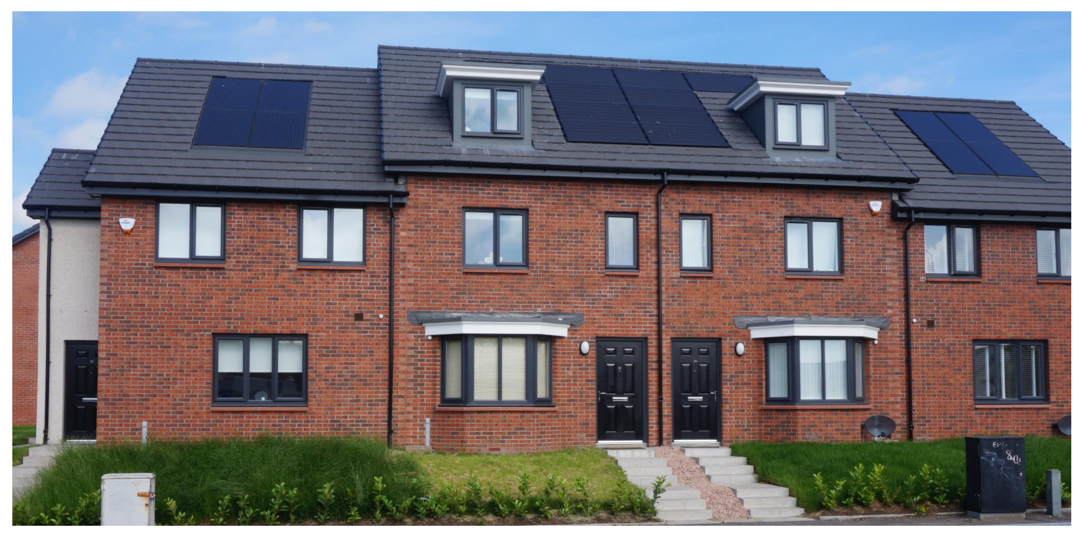
Renewable technology used in new housing development at Shortroods, Paisley