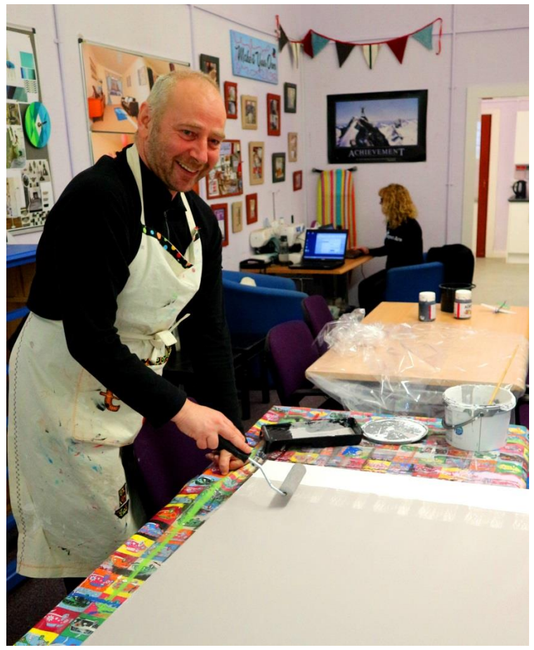
Make it Your Own (MIYO) delivered by Impact Arts