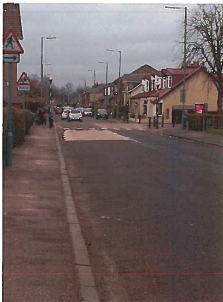
Looking north east along Sandy Road to pedestrian crossing