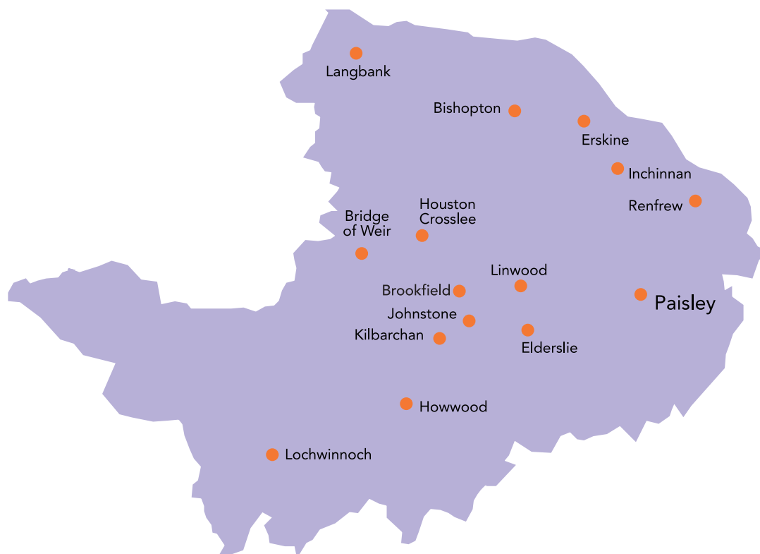
Map of Renfrewshire

The Development Plan aims to guide the use and development of land indicating where development or changes in land use should or should not take place. It sets out policies that provide the basis for planning decisions.