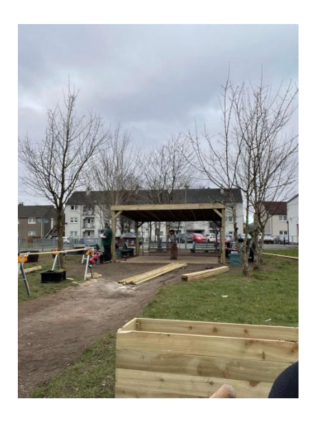
The Final Look