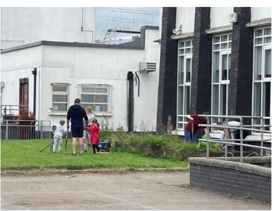
Be gone huge roots!